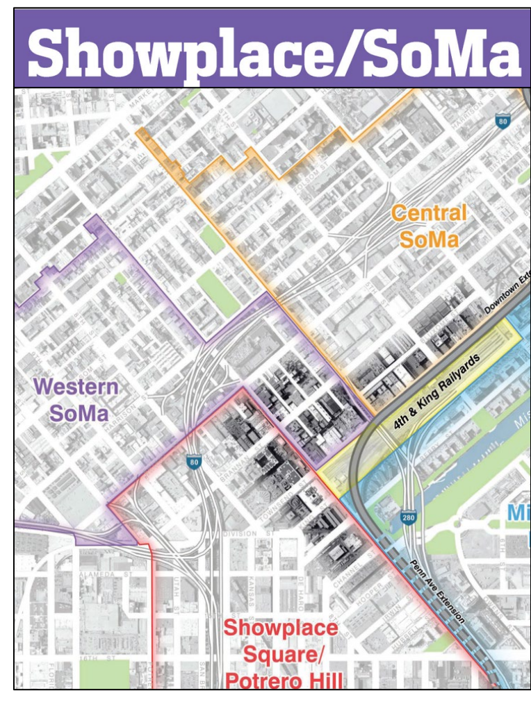
2019, paused in March 2020 Showplace/Soma Neighborhood Analysis &

Showplace/Soma Neighborhood Analysis & Coordination Study (SNACS)