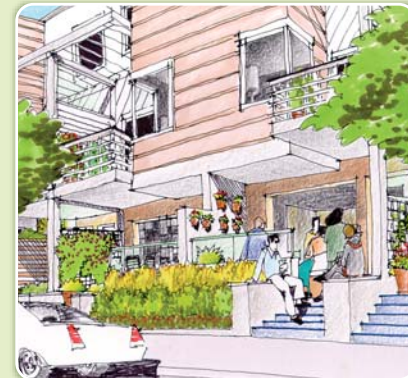
Example of street-engaging design