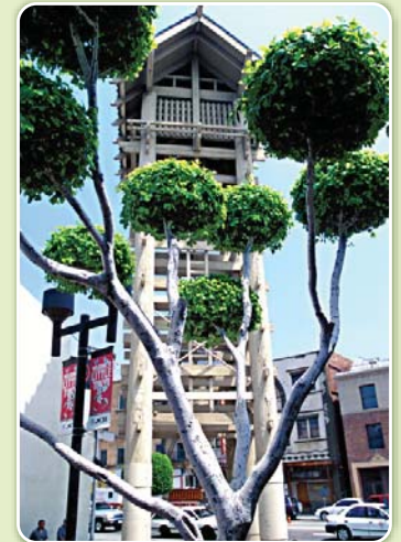
Little Tokyo, LA, California