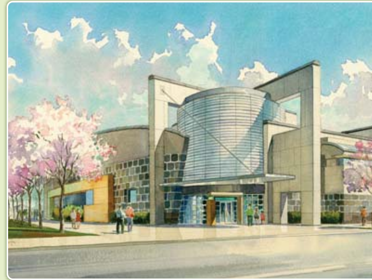
Little Tokyo, LA, California Proposed Recreation Center

These examples are from other American cities that have used Japanese-influenced design, ranging from traditional to modern, and large to small. These examples are neither good nor bad, but allow food for thought about what potential new development in San Francisco's Japantown could look like.