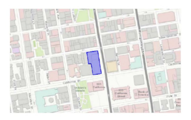
Figure 1 Location of 600 California Street