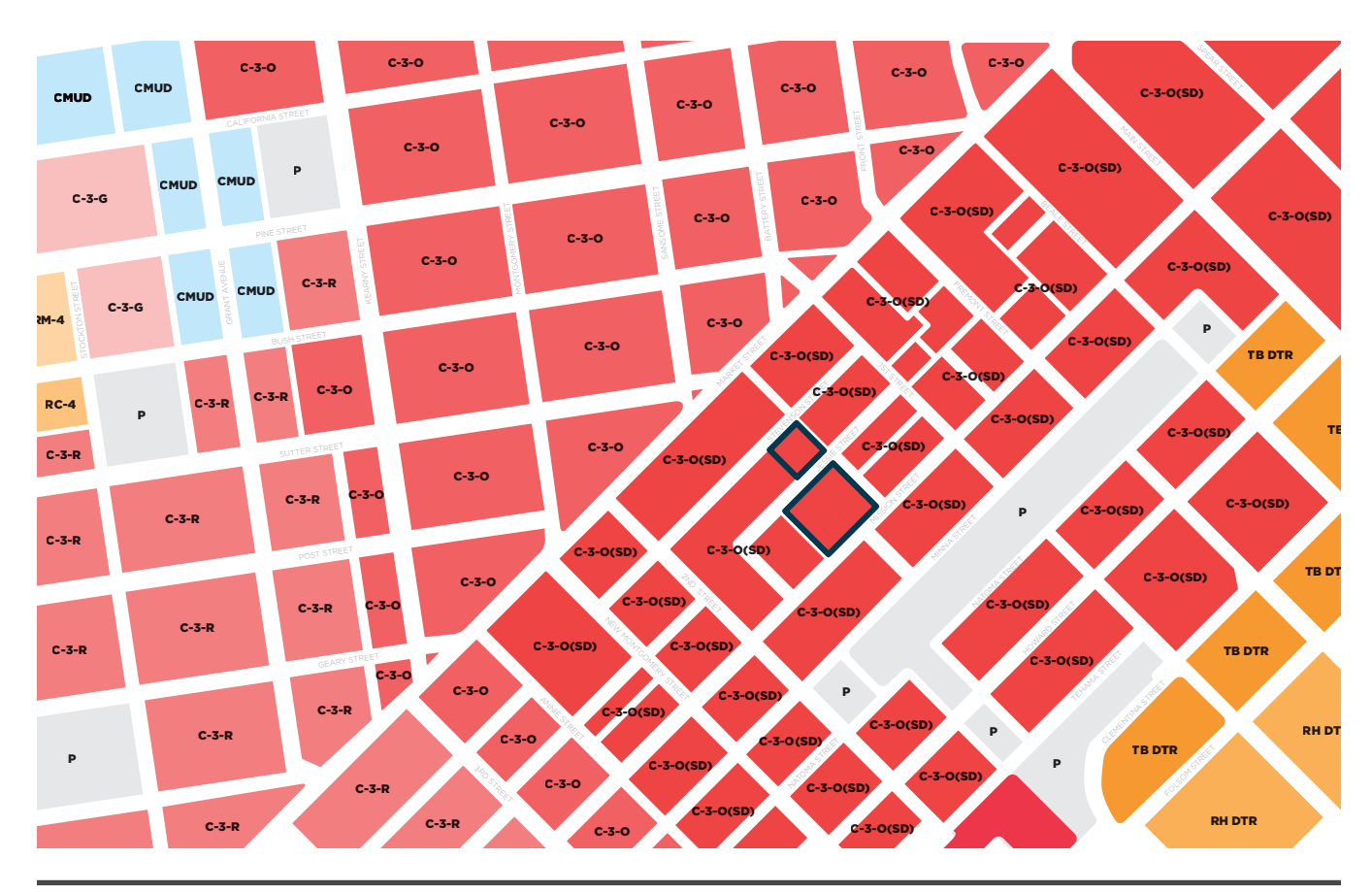
2015 San Francisco Zoning Map of parcels in proximity to Golden Gate University