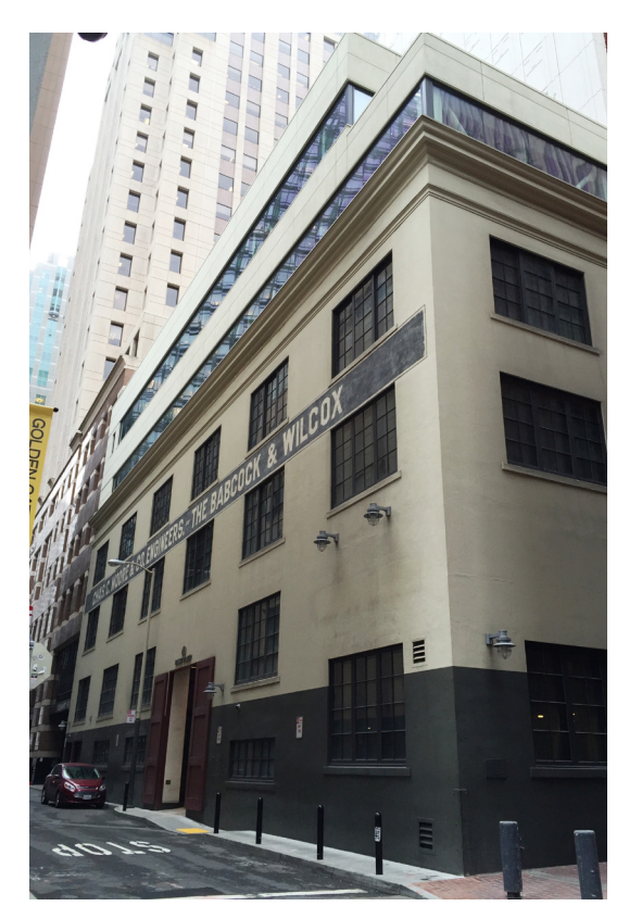
GGU Properties: 536 Mission and 40 Jessie Streets