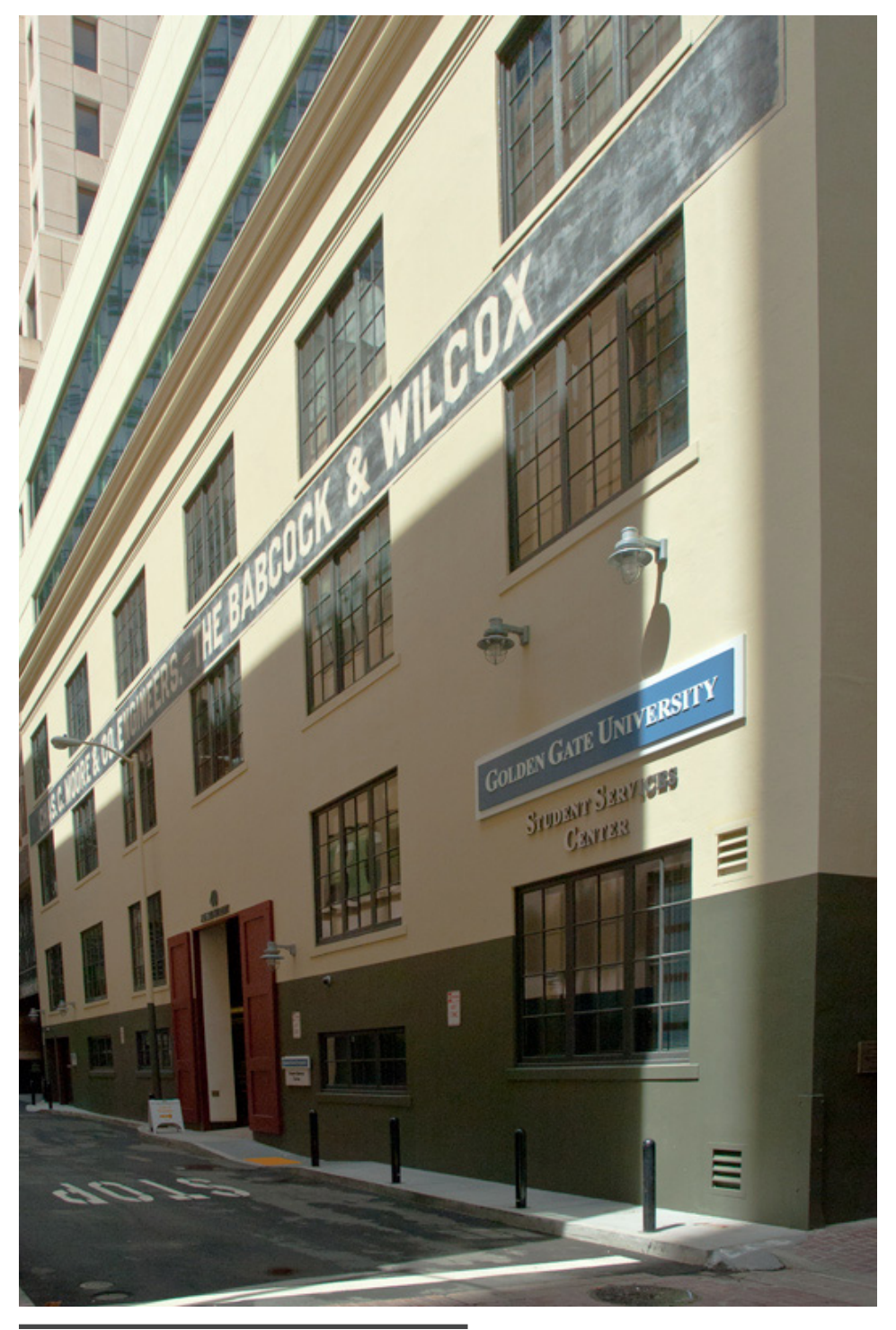
40 Jessie Property, a former printing warehouse.