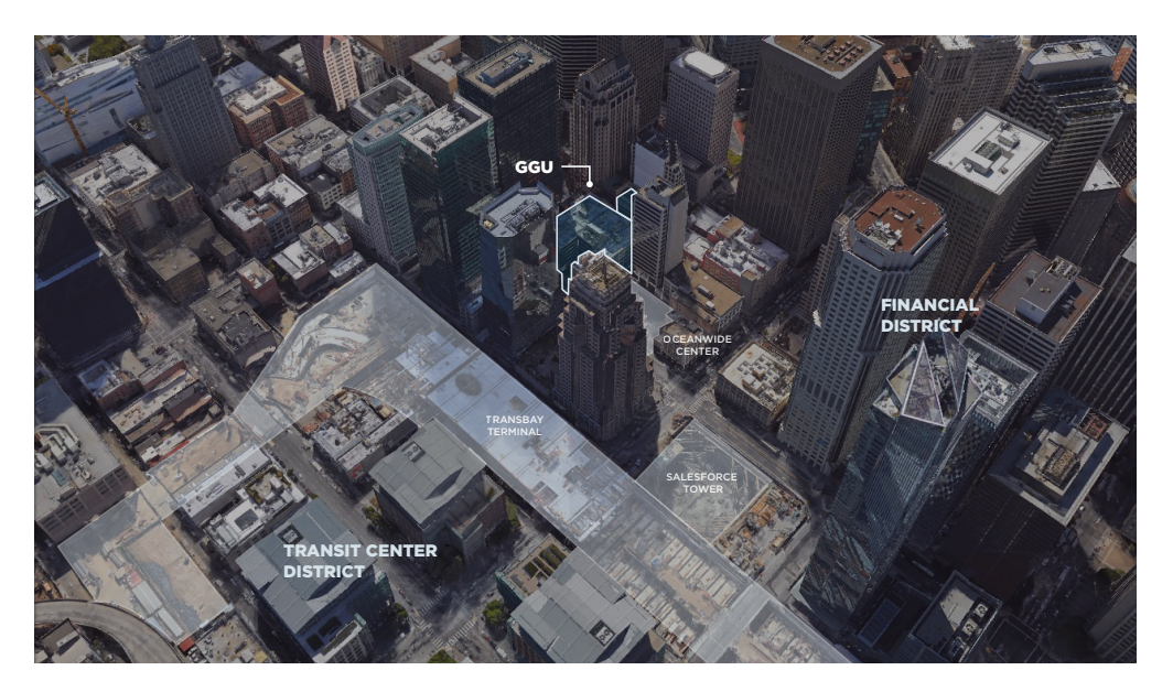
Aerial view of GGU's existing buildings and the surrounding neighborhood. Nearby, development projects associated with the Transbay Terminal are under construction.