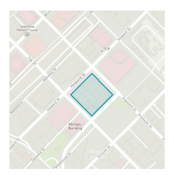
Figure 1 Location of the Premises