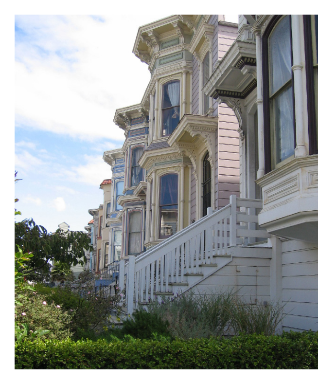
Front yard setbacks that not only enliven the public realm but also represent the historic pattern of development should be maintained and protected. When a garage is necessary, it should be inserted into the building, avoiding impacts on the characterdefining features of the building and the displacement of any ground floor residential units.