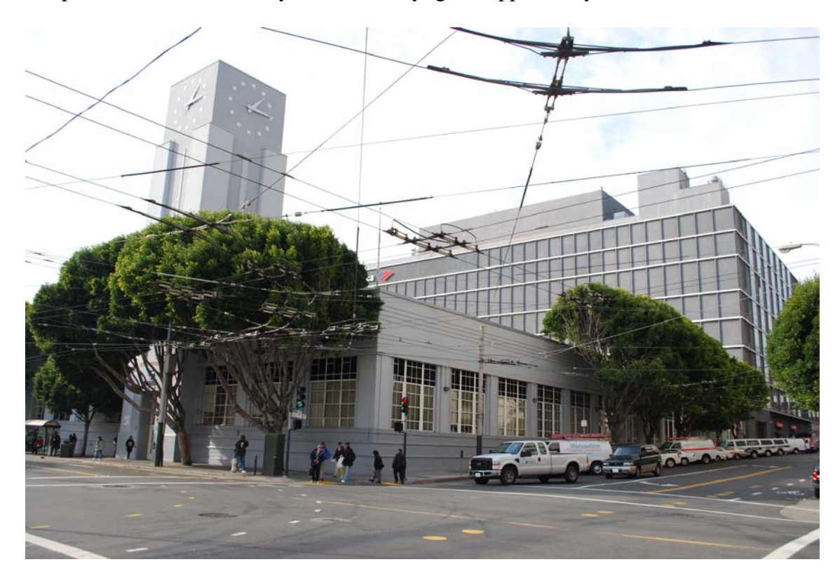
View looking west, December 2009

From a Mission Street entrance the interior of the building is visible. Most of the interior is devoted to a large work space. It is illuminated by a series of skylights supported by steel trusses.