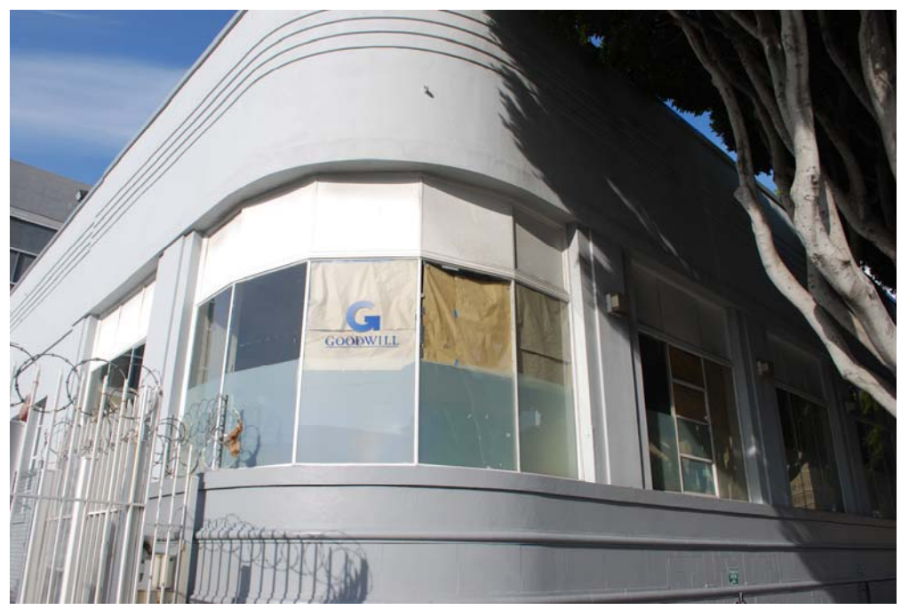
Top photo: windows, 11th Street side Bottom photo: rounded corner at south end of building