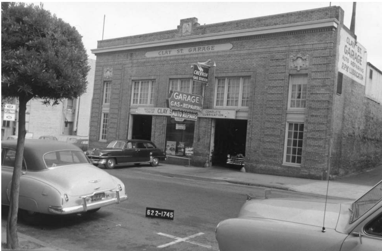
Undated photo of 1745 Clay Street.

All original windows and doors have been replaced. In the upper story, windows are now covered with awnings. In the first story, they have been replaced by louvered shutters.