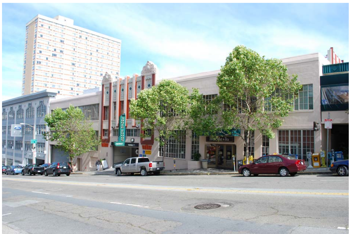
Top photo: Detail of central pavilion. Bottom photo: View looking southeast.