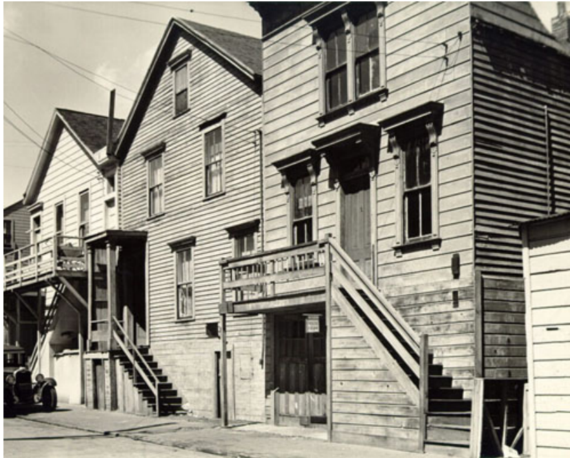
Fig. 2 Circa 1925 image which appears to show 452-454 Ivy Street (middle building).

452-454 Ivy Street retains integrity of location, setting and feeling, but has lost some integrity of design, materials, and workmanship through window replacement, re-cladding the façade with wood shingle siding, and garage installation. The overall physical form and massing of the building remain the same, however, as do major envelope openings. The building has also lost some integrity of association through conversion to a multiple family property post World War II, though this type of conversion was common in San Francisco during that period.