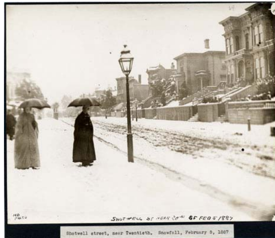
Shotwell Street near 20 th Street, February 5, 1887. (San Francisco Public Library Historical Photograph Collection Photo ID AAB-5310 and AAB-5309).

In the 1850s and early 1860s, the district area, which runs through the center of the Mission District valley, was occupied by a pair of racetracks. The northern portion contained the Union Race Course. The half-mile racetrack was renovated in 1862 and renamed the Willows Trotting Park, but the increasing value of land in the Mission District proved more valuable than spectator ticket fees, and the final race was run on July 18, 1863. The area's development as one of the Mission's earliest residential suburbs followed soon thereafter, spurred on by the extension of horse-drawn streetcar lines on Folsom and Howard Streets.