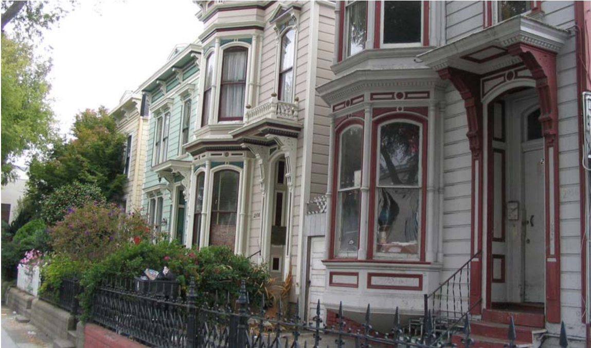
West side of Folsom Street south of 25 th Street.

former Union Race Course, the western portion of the Pioneer Race Course (the area nearest to early transit lines on Folsom and Howard Streets) was subdivided and built out as one of the Mission's first neighborhoods. Extensions and improvements to these transit lines in the 1880s and 1890s promoted a near complete build-out of the area.