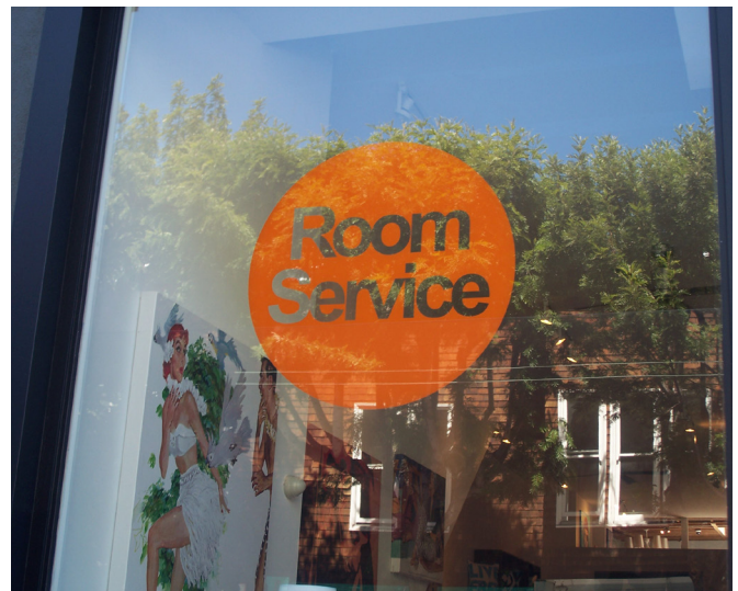
ABOVE: Window signs should be limited in size and number to maximize visibility inside the store.