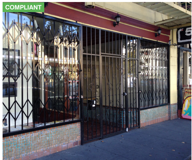
2) Security gates or grillwork on the inside or outside of the window glass must be primarily transparent (at least 75% open to perpendicular view).