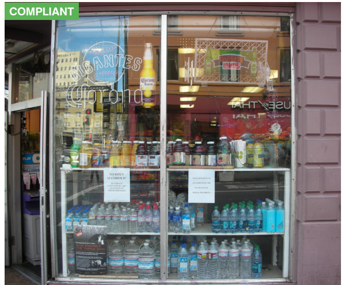
1) Windows that have been covered over with boards, film, or paint must be restored to transparency.