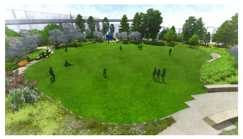
Detail: Dog-free South Meadow