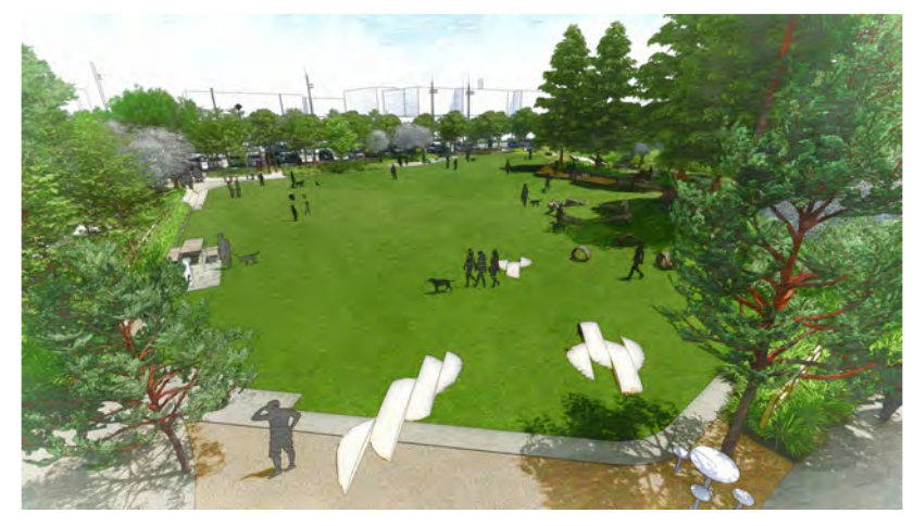
Detail: Off Leash Dog Play Area North Meadow