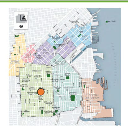
Improvements Include: Seismic, structural and feasibility analysis to identify potential improvements