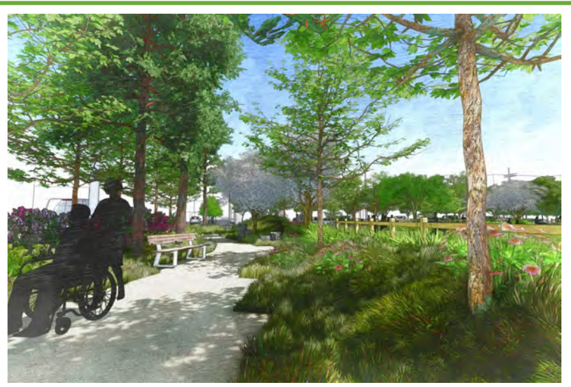
Detail: Pathways, Seating, Planting